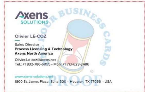
Proof may not be to Scale - Red Box is the Edge of the Card and will NOT be printed