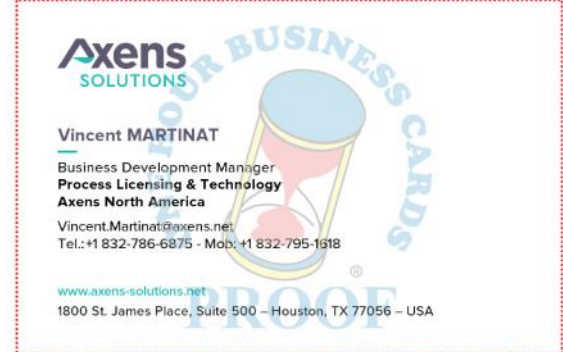
Proof may not be to Scale - Red Box is the Edge of the Card and will NOT be printed

** When proofing a layout that is in COLOR: There may be up to, but not limited to a 10% variance in color from what you see on the screen to what comes off our presses (especially when printing watermarks and/or scaled down colors). All computer screens will display colors differently. If color is important to you, please come by and see a printed proof. We will not be held responsible for the colors being different from what you expect, unless you sign off on a printed proof. **STOCK ** Our paper stock is a 100# white matt stock (standard). If you are not sure if this is thick enough for you we urge you to visit the store, we will not be responsible if the thickness is not to your standards or likeness.