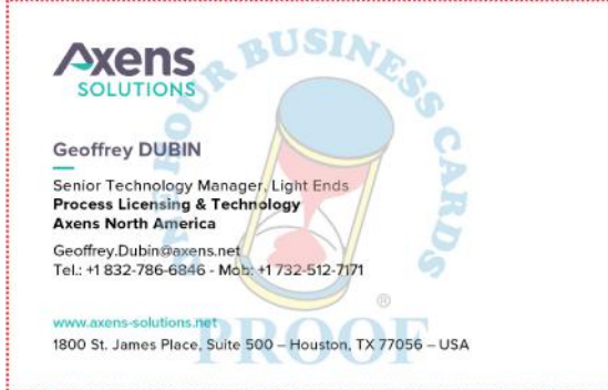
Proof may not be to Scale - Red Box is the Edge of the Card and will NOT be printed