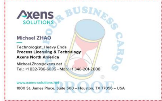
Proof may not be to Scale - Red Box is the Edge of the Card and will NOT be printed