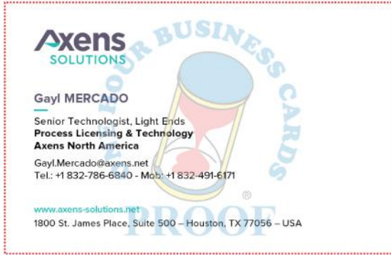
Proof may not be to Scale - Red Box is the Edge of the Card and will NOT be printed