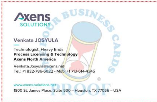
Proof may not be to Scale - Red Box is the Edge of the Card and will NOT be printed